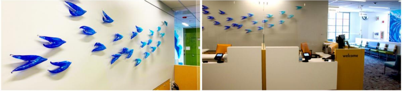
Lea de Wit, Let your spirit fly (2022). Hand-blown glass.

A hand-blown glass work by Lea de Wit, entitled Let your spirit fly , draws on the local fauna found within Santa Cruz. This custom bird installation is mounted behind the reception desk.